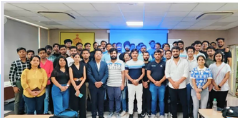
NASSCOM-COE, HARTRON, Gurugram