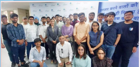
istory, Bhamashah Techno Hub, Jaipur