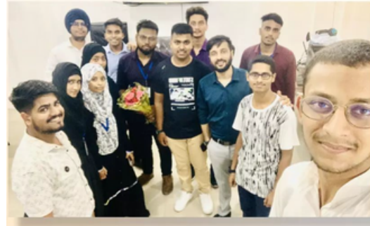
Warlock Security, Lucknow