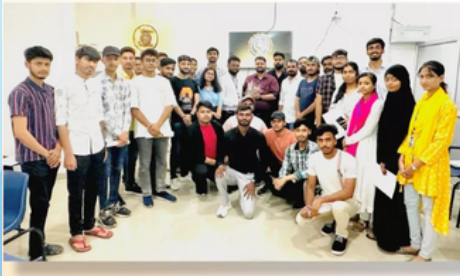
Warlock Security, Lucknow