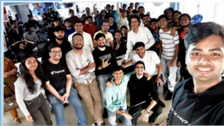
Zone Startups, Mumbai